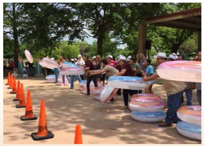
Continued on page 5...

Thanks to local vendors and campus departments who donated to this event, over 75 door prizes were given out!