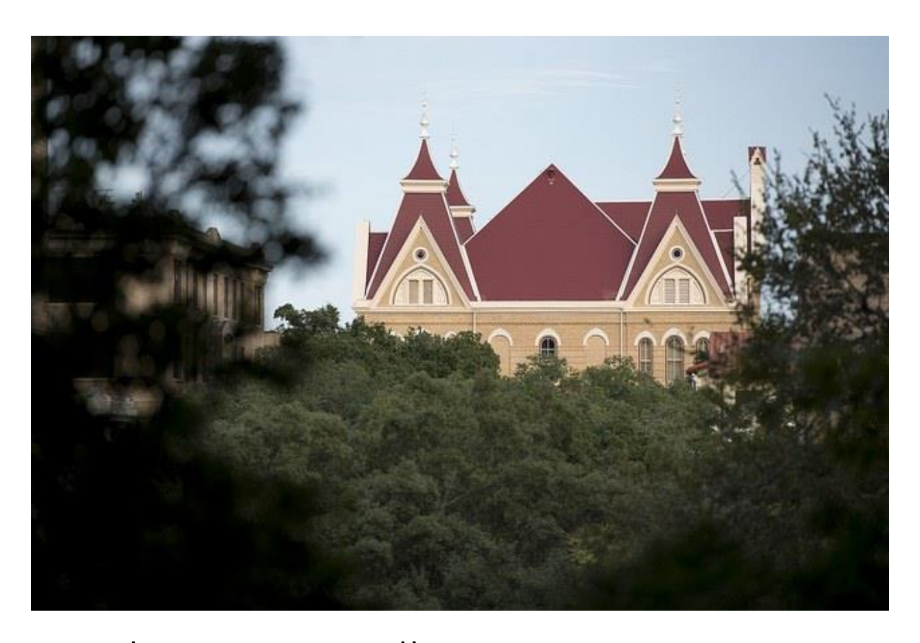
Faculty Senate Bulletin