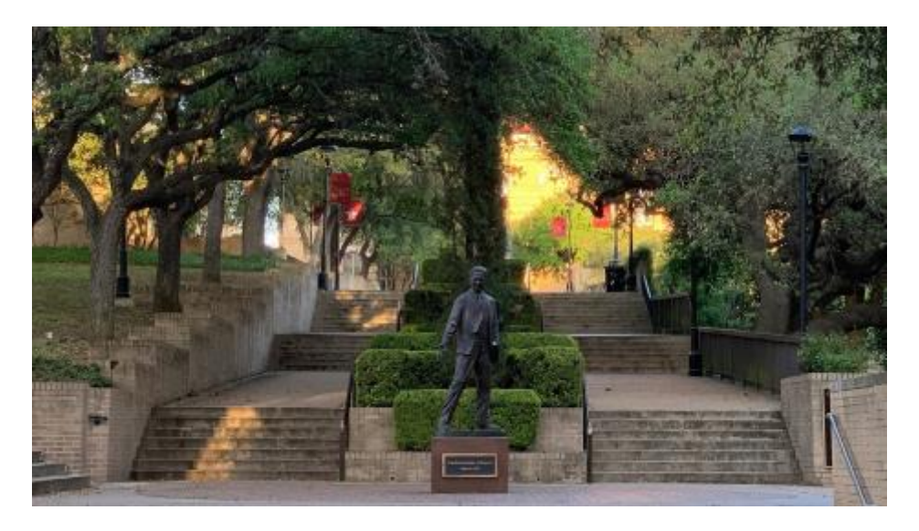
1 - Photo credit: Twister Marquiss