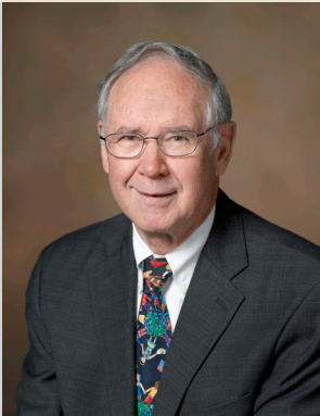
Gilbert M. Grosvenor, Chairman Emeritus, National Geographic Society

“As the world grows smaller and more interdependent daily, our country’s future absolutely depends on our ability to see the connections between ourselves and our global neighbors.”