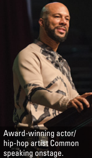
Award-winning actor/hip-hop artist Common speaking onstage.

Texas State presents an academic theme each year with related events for everyone. Freshmen are provided the year's selected book related to the theme and discuss it in University Seminar and other courses.