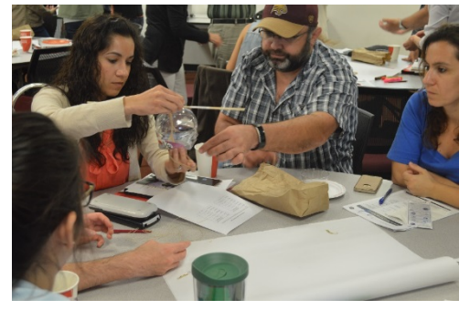
The Minority Serving Institutions Teacher Education Network

Such a commitment requires reaching out to educators and tailoring professional development that meets the needs of their students and addresses their district priorities.