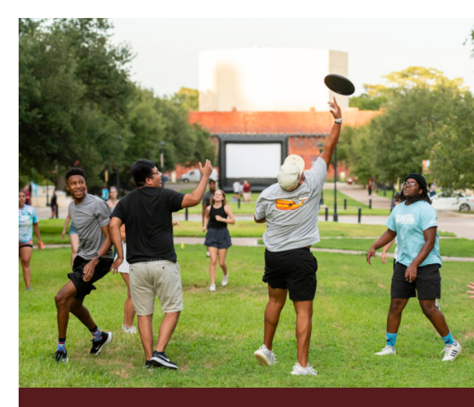
Students enjoy a game of frisbee on the Concho Green