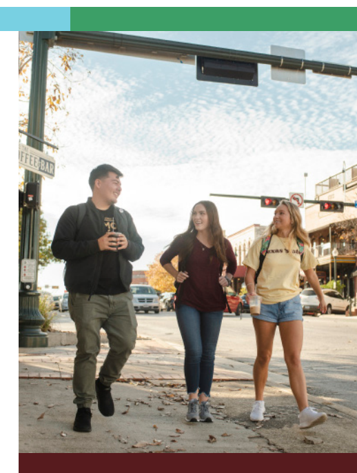
Enjoy downtown San Marcos for some drinks, food, and entertainment.

San Marcos is home to the Premium Outlets and Tanger Outlet Center, the third-largest tourist attraction in Texas. Nearby Austin and San Antonio also offers large shopping centers and malls. Austin is also home to the Whole Foods Market corporate headquarters and the company's flagship store. Shop for local arts and crafts at Market Days in Wimberley or Gruene. San Marcos residents enjoy perusing The San Marcos Farmers Market which offers local produce and homemade products.