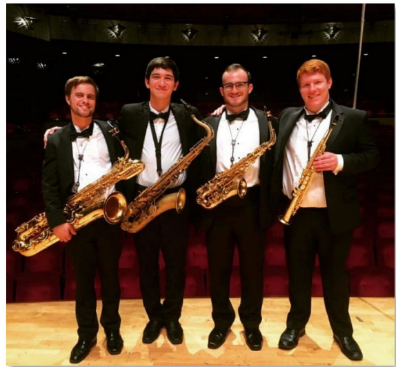
Wind Symphony Saxophone Section