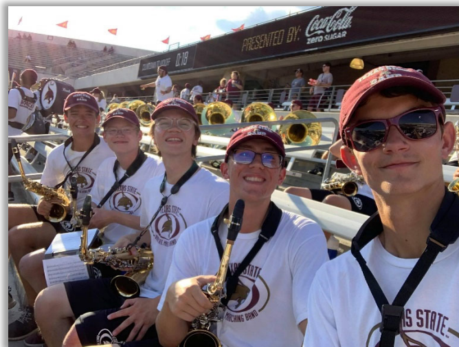
Bobcat Marching Band Saxes