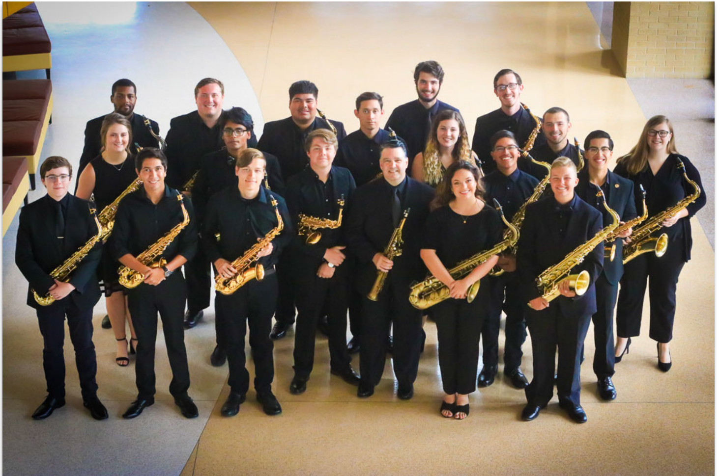
Bobcat Saxophone Studio