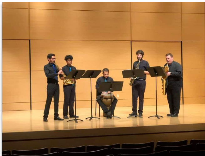
Blue Sine Quartet