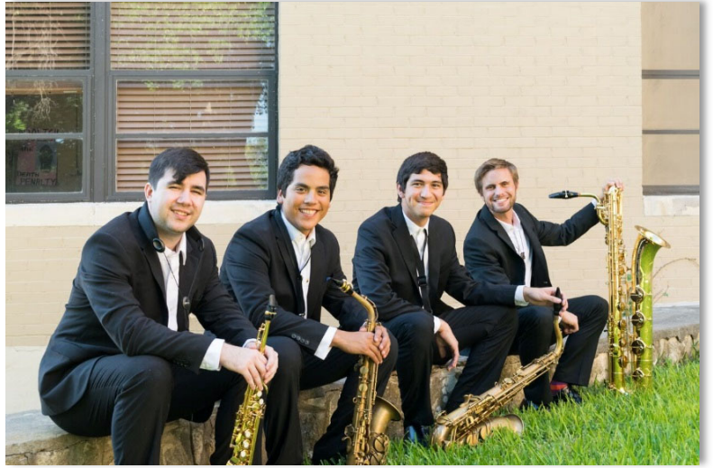
SONUS Saxophone Quartet