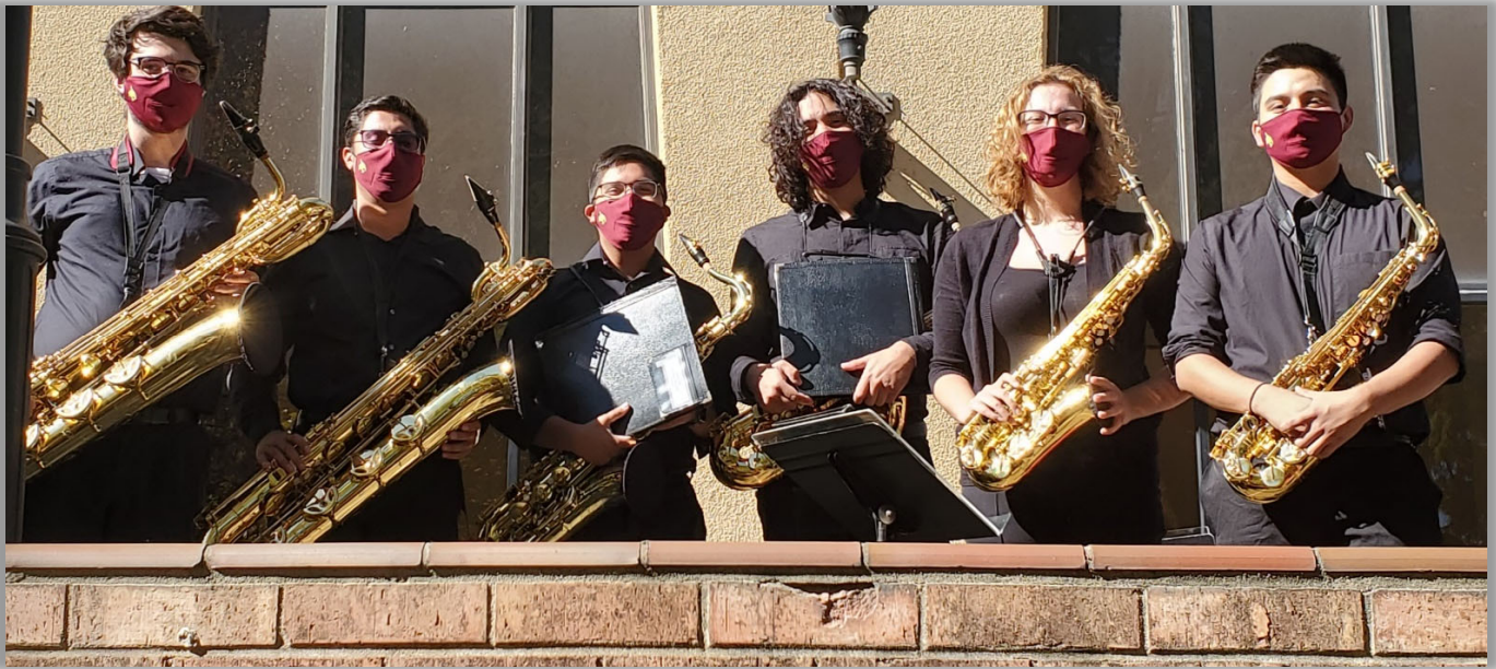
Symphonic Winds Saxophone Section