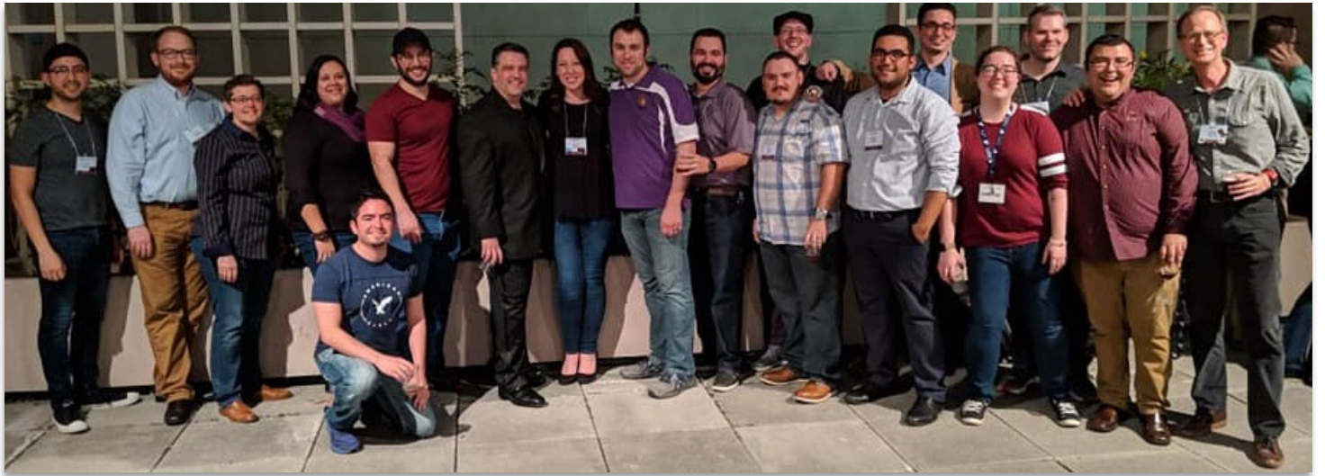
Bobcat Saxophone Studio Alumni