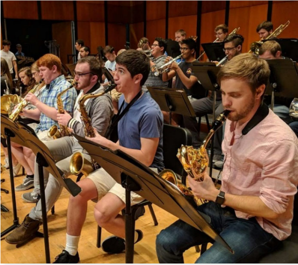
Wind Symphony Saxophone Section "On Tour"