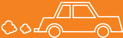
OIL AND GASOLINE