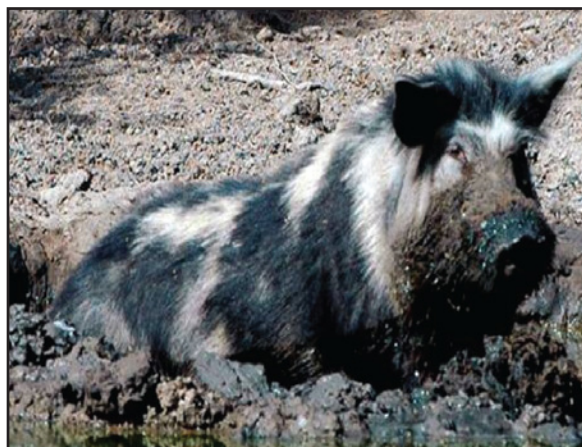
Feral hog wallowing along a water source.

Texas Stream Team Headwaters Vol. # 4 No. # 2, 2011