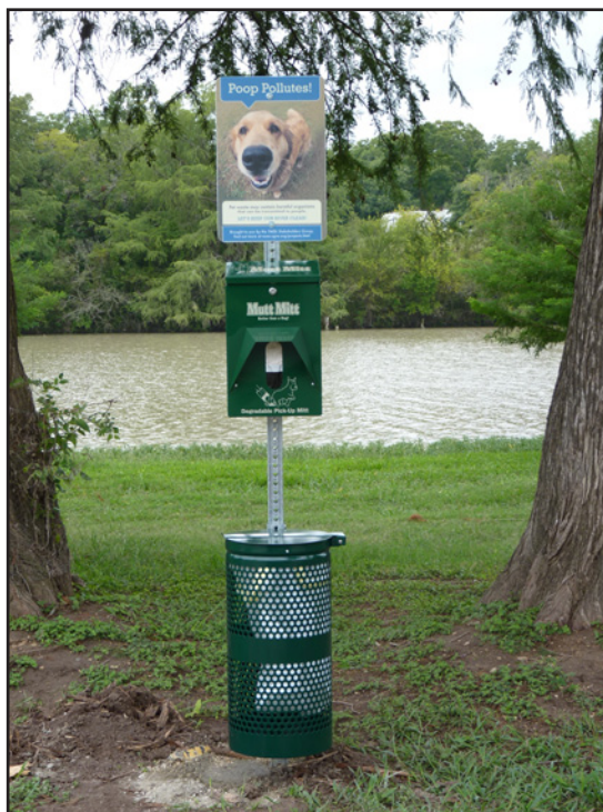
One of seven pet waste stations with degradable "pick-up mitts" in Flat Rock Park.

UGRA has applied to TCEQ for a Clean Water Act §319(h) grant which outlines a combination of strategies to curtail sources of E. coli bacteria in the impaired section of river. This project, called "The Bacteria Reduction