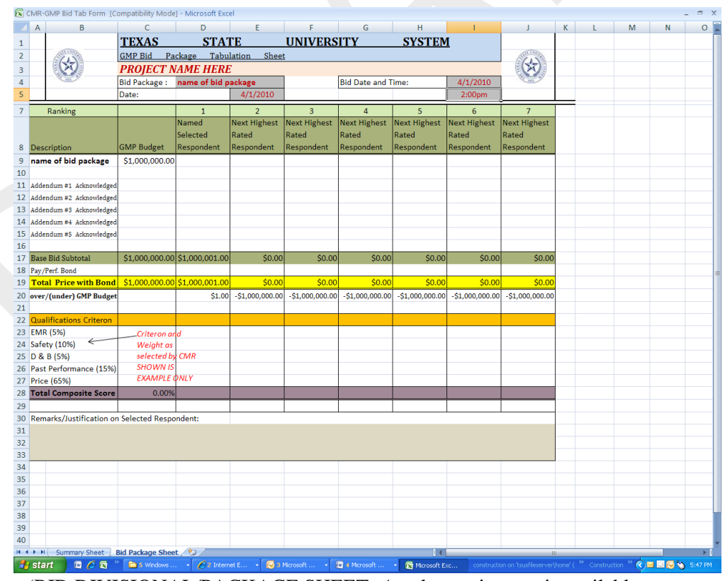
(BID DIVISIONAL/PACKAGE SHEET- An electronic copy is available upon request)