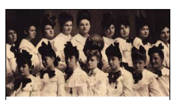
The Gypsies - The 1904 Women's Basketball Team Women's basketball was the first varsity sport at Southwest Texas State Normal School.

In 1999, as part of the centennial celebration of the university's founding, the SWT President's Council for Women in Higher Education commissioned the exhibit titled Southwest Texas Women: The First Hundred Years (1899-1999). Installed for nine months in