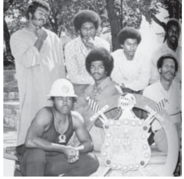
Omega Psi Phi Fraternity, Inc. was the first black fraternity at SWT, chapter founded in 1972.