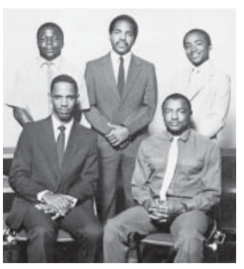
Fall 1985, Alpha Phi Alpha Fraternity, Inc. recognized for the highest GPA of all SWT Greek organizations.