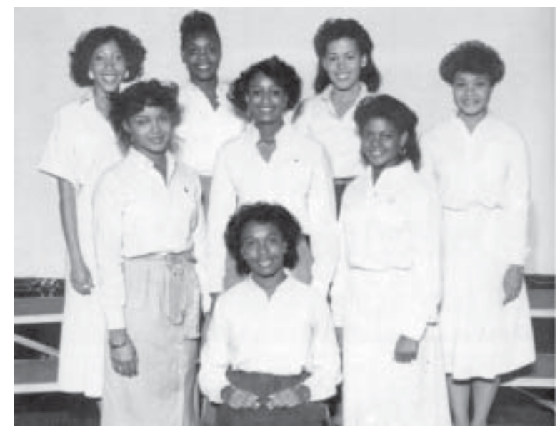
Alpha Kappa Alpha Sorority, Inc., SWT chapter founded in 1984.