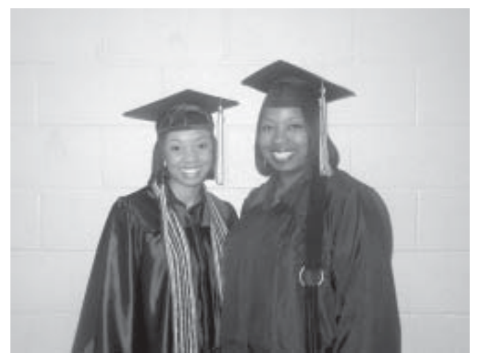
Two of the SWT December 2002 Graduates.