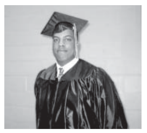
One of the SWT December 2002 Graduates.