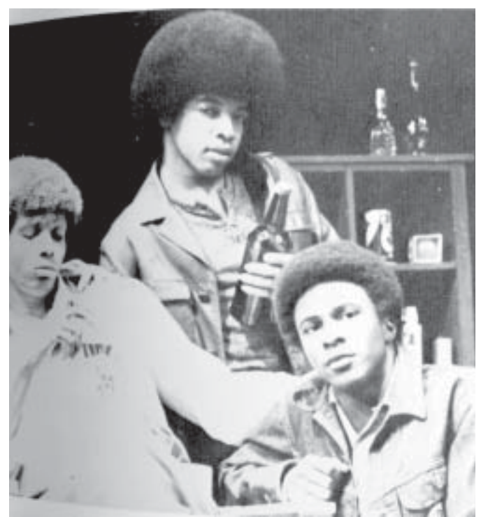
Ebony Players, scene from play, 1970s