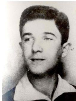
Mordecai Anielewicz, the 23yr old leader of the Warsaw Ghetto Uprising

It has been over 50 years since the Holocaust. To survivors, the Holocaust remains real and ever-present, but for some others, fifty years makes the Holocaust seem part of ancient history. Year round we attempt to fight against ignorance with education and against disbelief with proof. However, there is one day in the year when we make a special effort to remember (Zachor). On this day, we remember those that suffered, those that fought, and those that died.