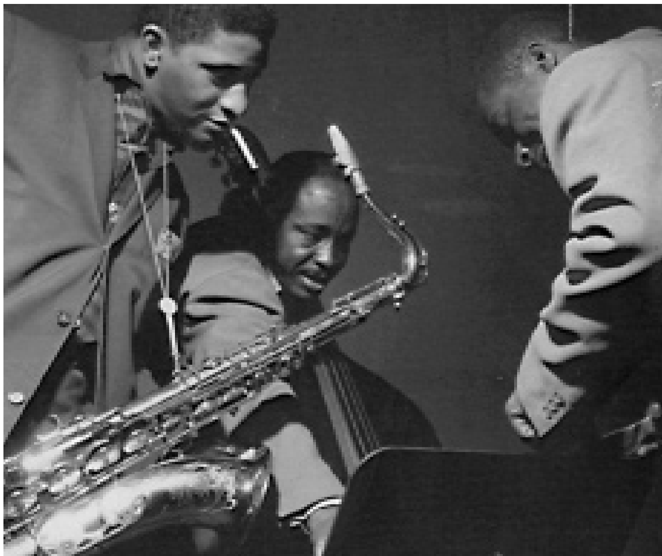
Woody Herman, courtesy of Storyville Records.

the black American people, in the search of something from the heart, have not introduced any extensions of the movement that have been too intellectual. In my opinion, in order to survive, jazz must stay an art of the people. 91