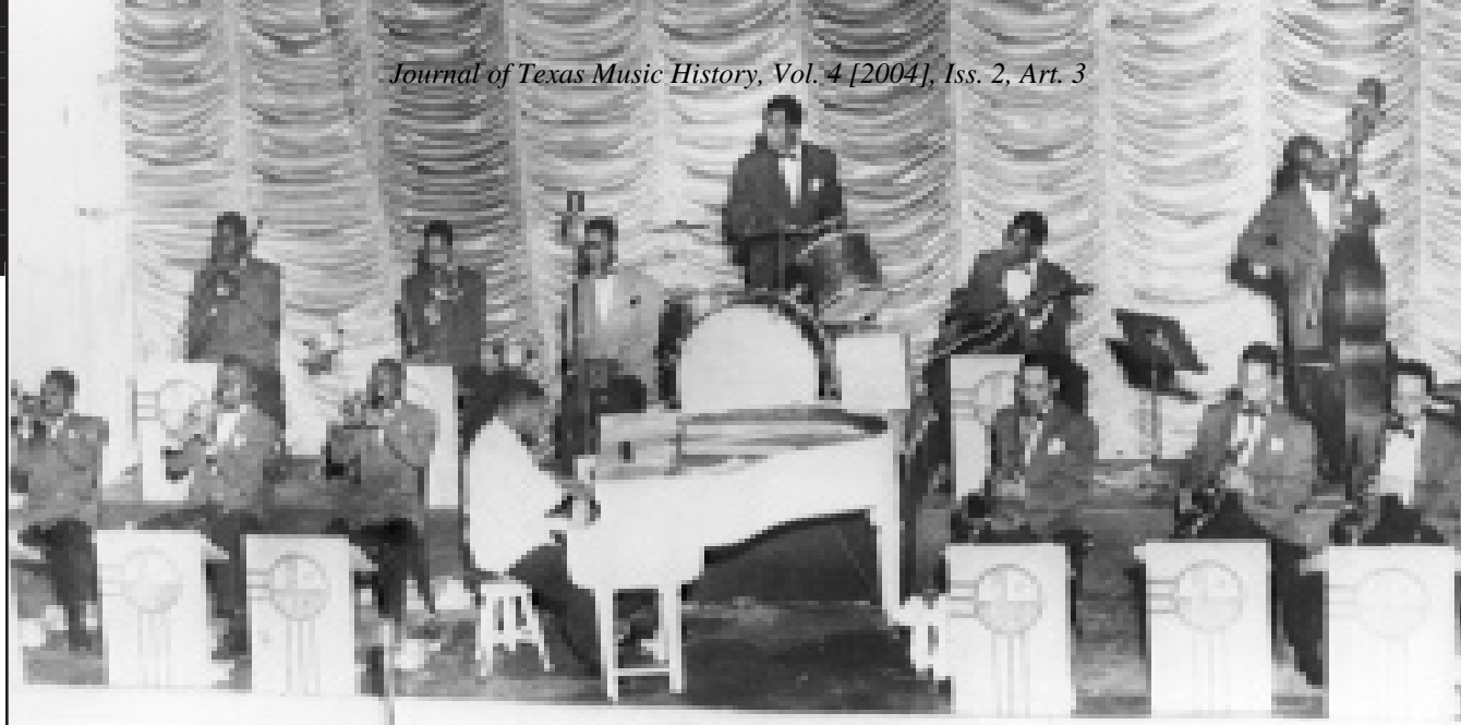
Woody Herman

(Savoy 0123) George Shearing, So Rare , 1947-49 (Proper/Savoy 1117) Stan Getz, Stan Getz' Quartets , 1949-50 (Original Jazz Classics 121) J.J. Johnson, J.J. Johnson's Jazz Quintets , 1950 (Savoy 0151) Miles Davis, Birdland Days , 1950-52 (Fresh Sound 124/Charly Le Jazz 23) 126 Lou Donaldson, Lou Donaldson Quartet, Quintet, Sextet , 1952 (Blue Note 1537) Horace Silver, Horace Silver Trio: Spotlight on Drums , 1952-53 (Blue Note 80906) Art Blakey, Hooray for Blakey , 1953 (Session 110) 127 Count Basie, New Year at Birdland , 1953 (Tokuma [Japan] 30142) Various Artists, The Birdlanders , Vols. 1-2, 1954 (Fantasy/OJC 1930-1 2) Ruby Braff, The Mighty Braff , 1955 (Affinity 757) Sonny Rollins, Sonny Rollins: Volume One , 1956 (Blue Note B21Y-81542-2) Lester Young, Masters of Jazz: Lester Young , 1951-56 (Storyville 4107) Lester Young, The Jazz Giants , 1956 (Verve 825 672-2) Lester Young-Teddy Wilson Quartet, Pres & Teddy , 1956 (Verve 831270) Teddy Wilson Trio, Complete Verve Recordings , 8 Vols., 1952-57 (Mosaic 8-173) John Coltrane, Cattin' with Coltrane and Quinichette , 1957 (P 7158/OJC 460/Dcc 1995) Vic Dickenson & Joe Thomas & Their All-Stars, Mainstream , 1958 (Atlantic 1303)