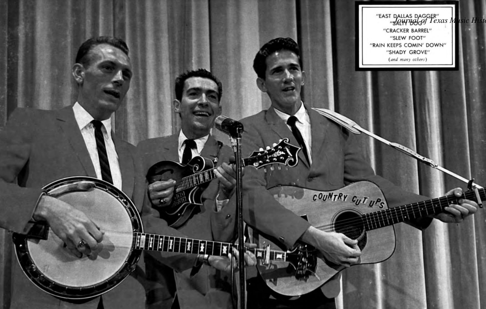
40 Country Cut-Ups