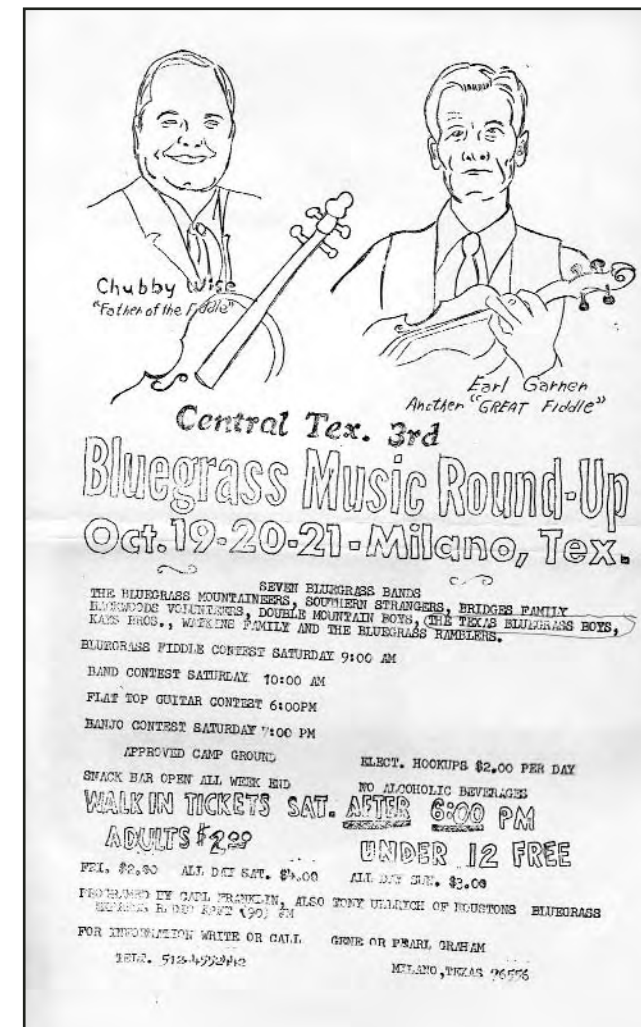
Hand-drawn poster for Milano Festival