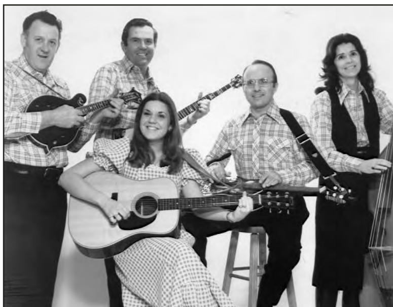
Grassfire