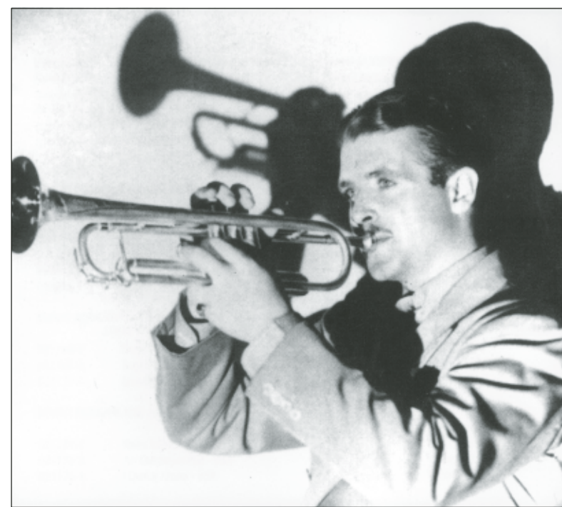
Bunny Berigan