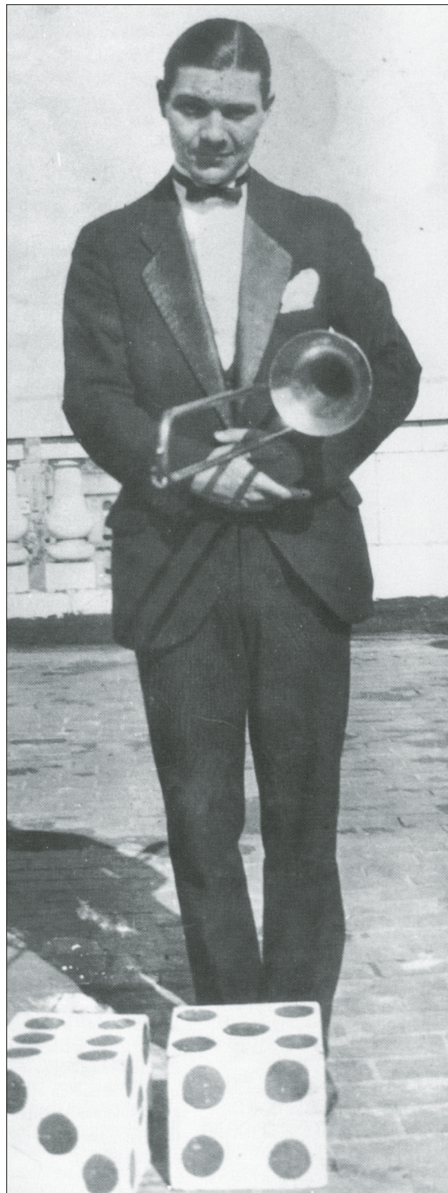
Jack Teagarden, courtesy of Franklin Driggs.

What distinguishes these musicians is, ultimately, less notable than what they have in common—a love of jazz that transcended regional boundaries and racial and cultural differences. Even if they created distinctive sounds on the same instruments, such sounds were not necessarily regional in nature but merely the result of different ways of approaching their horns, of holding them, or of positioning the mouthpieces on or between their lips and teeth. Without wishing to minimize the effect of differing backgrounds, I would emphasize the fact that, in jazz, any player can join with his fellows to produce happy or sad melodies and fast or slow rhythms that have appealed to listeners around the globe. Wisconsin and Texas, in this sense, are no different from Sweden or Japan, where jazz has also brought together peoples of differing races, religions, and geographical areas to find in music a common meeting ground for relieving the sorrow of loss and celebrating the joy of being alive. ■