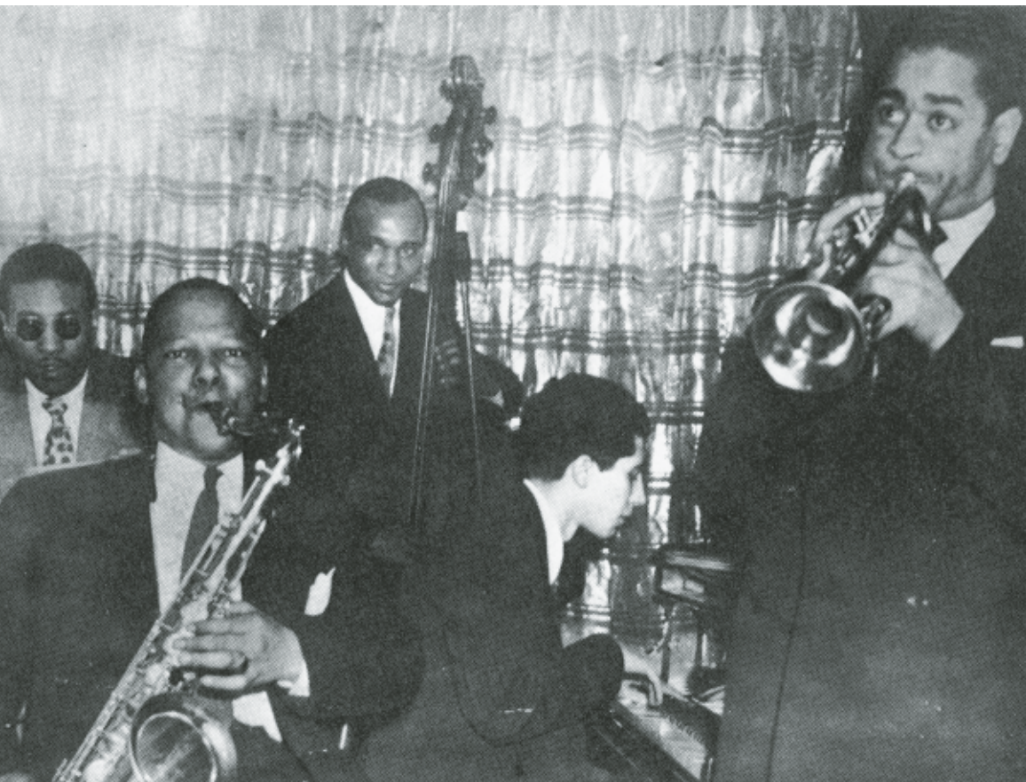
Budd Johnson on saxophone