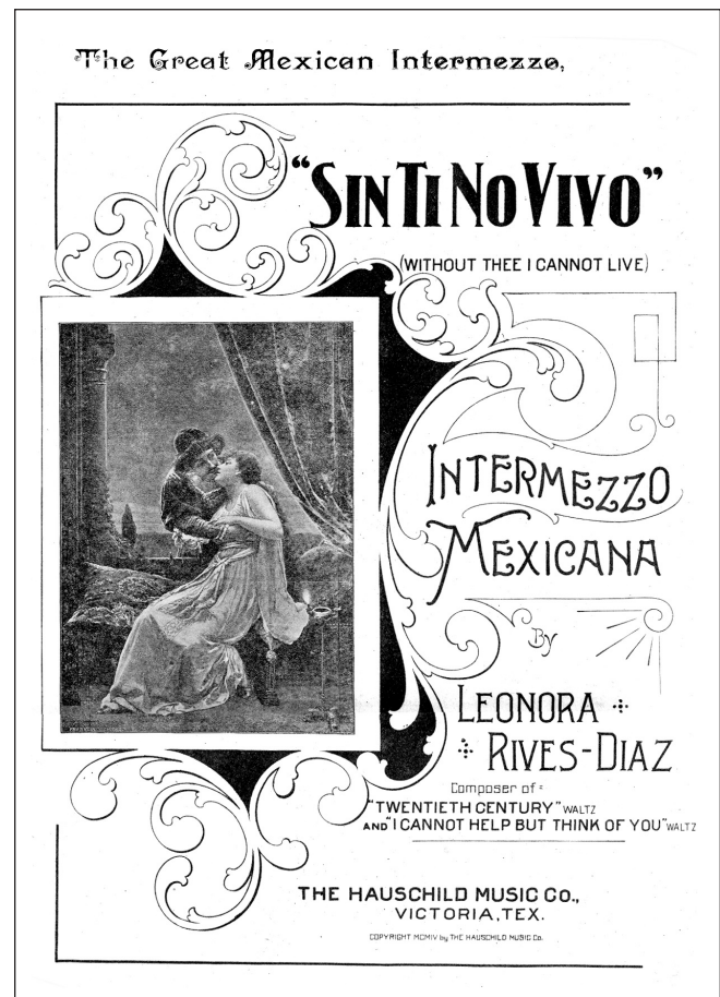
Sin Ti No Vivo