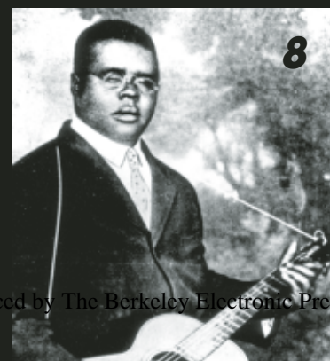
Produced by The Berkeley Electronic Press, 2003