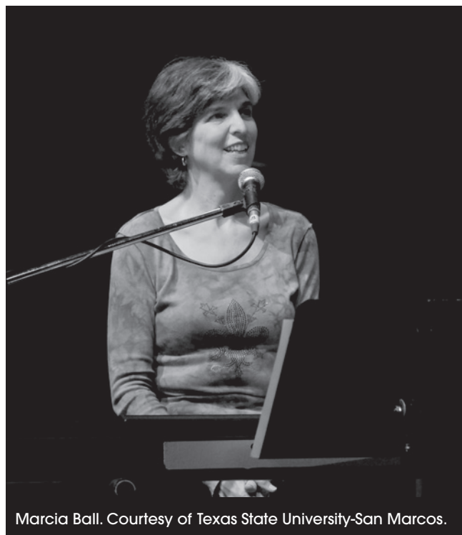
Marcia Ball.