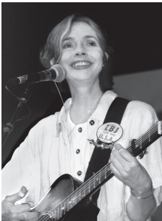
Nanci Griffith at the Kerrville Folk Festival.