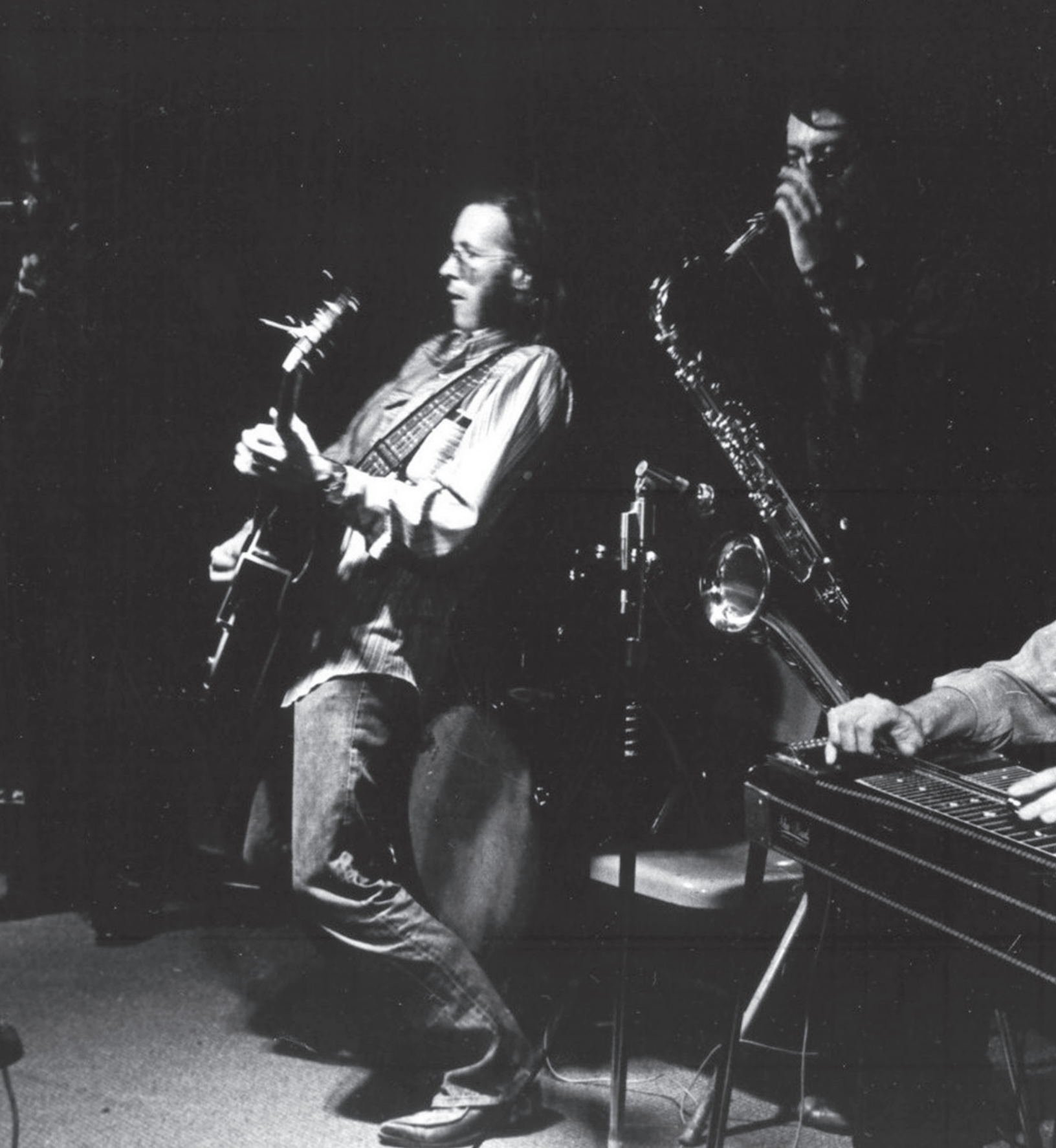
Doug Sahm at the Armadillo World Headquarters, 1973.