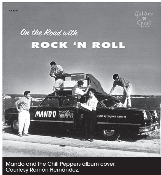
Mando and the Chili Peppers album cover.

In order to better understand how Texas-Mexican music reflects this process of selective assimilation within Mexican-American society, it is important to consider two different