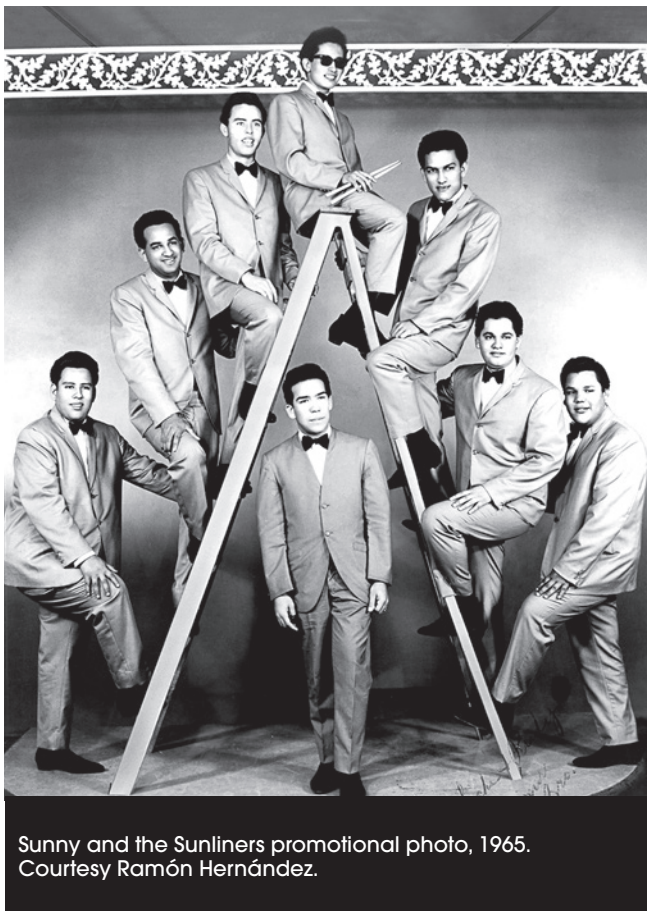
Sunny and the Sunliners promotional photo, 1965.

However, it was Clifford Scott's chart-topping single, "Honky Tonk," which he co-wrote with popular R&B recording artist Bill Doggett, that helped revolutionize the role of saxophone in early rock and roll music. Many West Side musicians consider "Honky Tonk" to be the "unofficial anthem" of the West Side