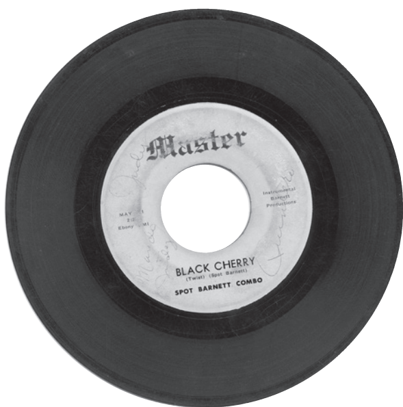
"Black Cherry," by the Spot Barnett Combo.