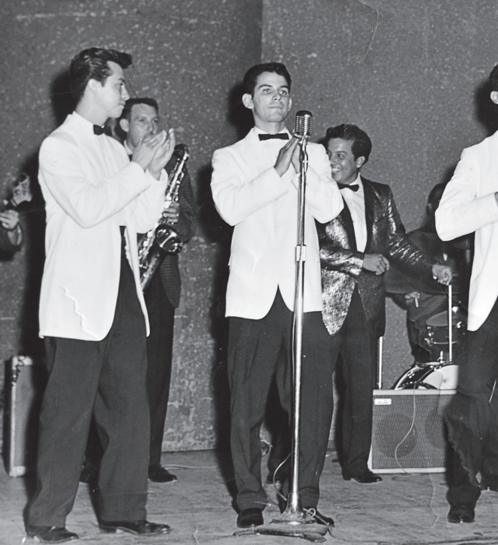
The Twisters (background) playing behind the Royal Jesters, ca 1958.