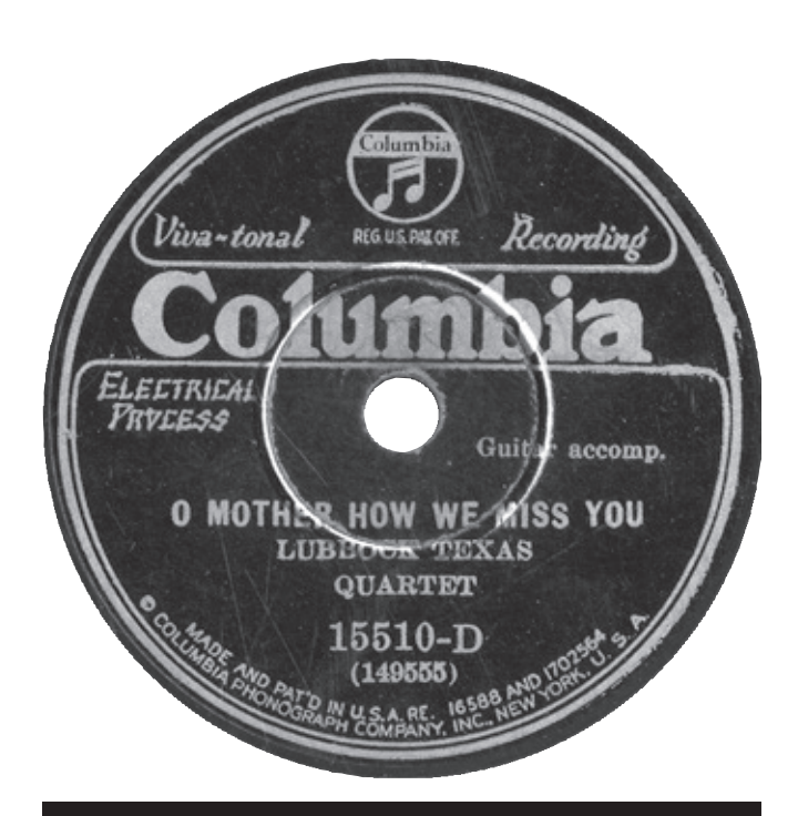
Lubbock Texas Quartet Columbia Record Label. "O Mother How We Miss You."