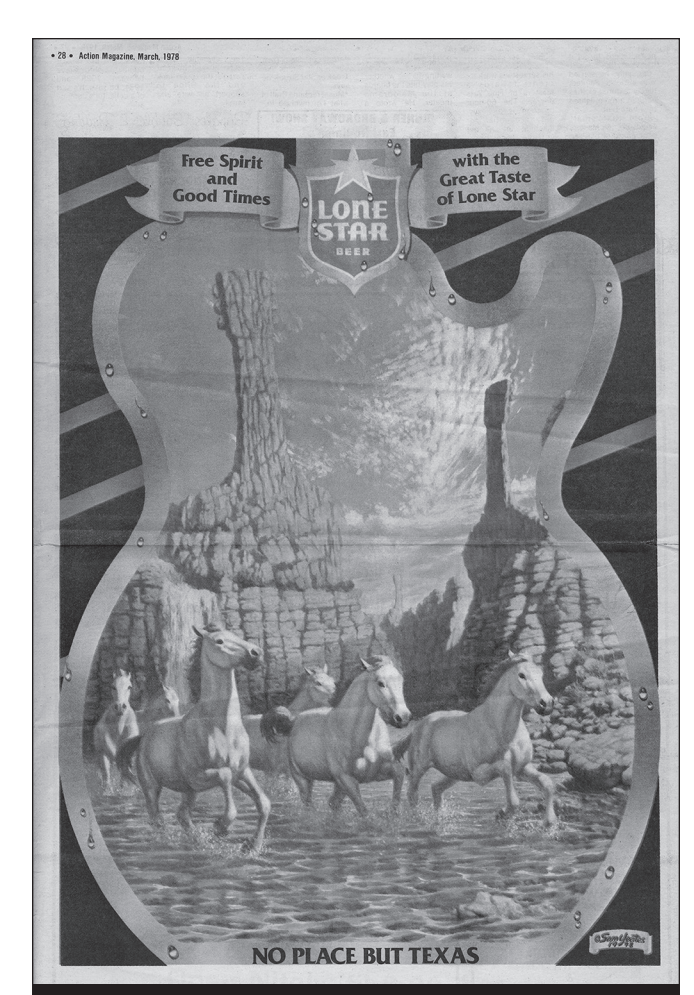
Poster of horses running through water.

his illustrations from 1978 features a group of horses running through shallow water at the bottom of a canyon. Rock formations above appear in the shape of electric guitars. At the top of the poster is the Lone Star logo with a variation of the tag being used in many radio spots at the time—"Free Spirits and Good Times with the Great Taste of Lone Star"—and below that—"No place but Texas."