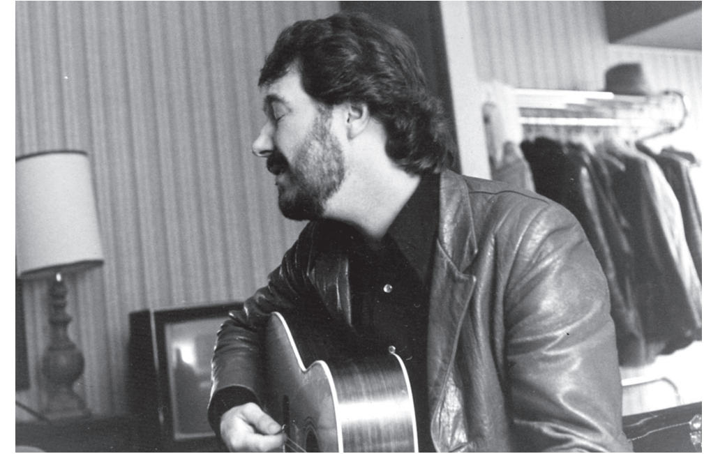
Jerry Jeff Walker, 1973.

lose all sense of time and space. Because no matter what time you go in there and close the door, it's twelve o'clock midnight. It always was. You don't know if you're making a rally or dying. It drives me fucking nuts. I don't like to play music in a dead space. I'm always saying, "Okay, can I be excused now? Can I go out in the street and be with real people?" You have to play music over and over too much. It loses all spontaneity. 10