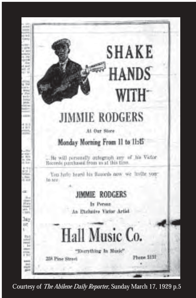
Sunday March 17, 1929 p.5

records. As the West Texas representative for Victor, Ford lived in and worked out of Sweetwater, forty-three miles west of Abilene on Texas Highway 1 (also known as the Bankhead Highway, later US 80, and now I-20). The plan appears to have been for Rodgers to “headquarter” in Sweetwater using the town as base of operations to “fulfill West Texas vaudeville engagements.” 11