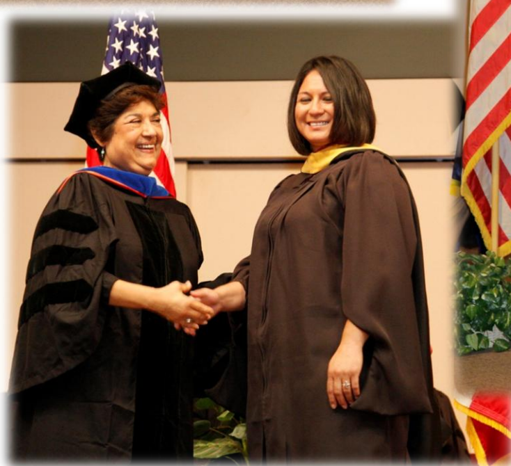
Students and Faculty celebrate at Hooding Ceremonies