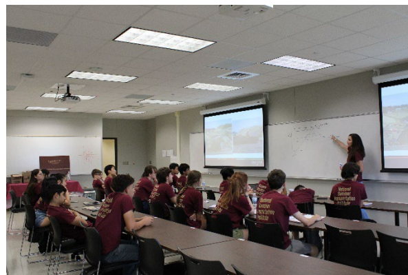
Figure 1: July 2023 National Summer Transportation Institute at Texas State University