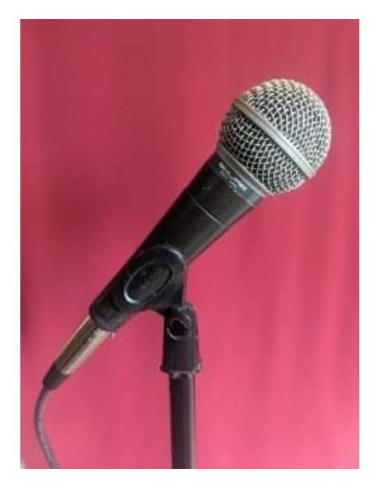
1 - Upcoming Events...