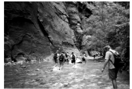
The walk up the Virgin River at Zion National Park.

Hesperus, Humphreys Peak, and Mt. Taylor or Tsodzil. It is fitting to summarize our trip with the Navajo song of Dawn Boy: "In the house of long life, there I wander. In the house of happiness, there I wander. Beauty before me, with it I wander. Beauty behind me, with it I wander. Beauty below me, with it I wander. Beauty above me, with it I wander. Beauty all around me, with it I wander. In old age traveling, with it I wander. On the beautiful trail I am, with it I wander."