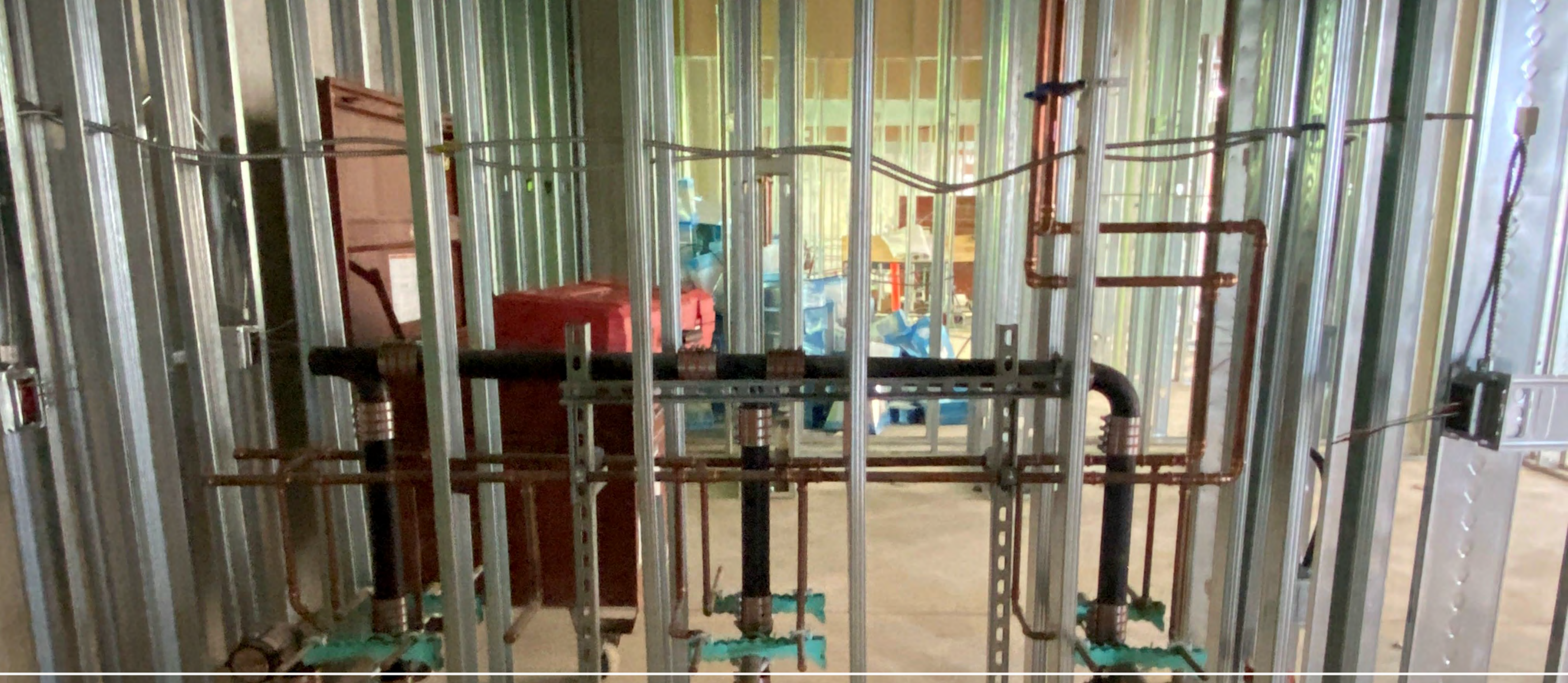
Canyon – Plumbing Rough-In (Level 1)