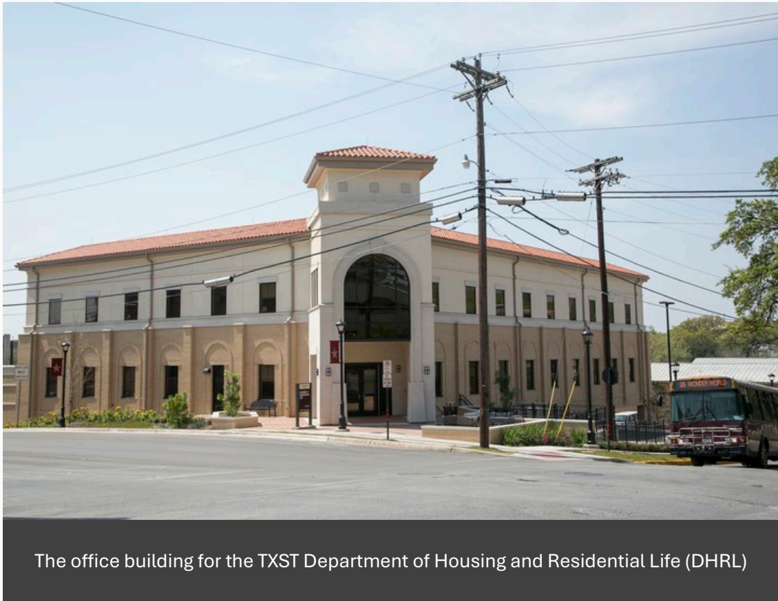
The office building for the TXST Department of Housing and Residential Life (DHRL)

Did you know that TXST has an entire department dedicated to housing?