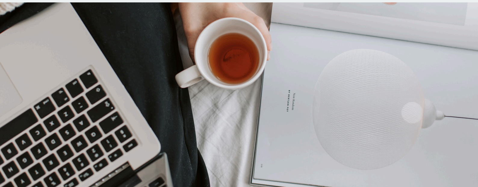
Exhibit professionalism, initiative, and a positive attitude in all your interactions. You will also be required to adhere to all TXST policies, guidelines and codes of conduct at all times.