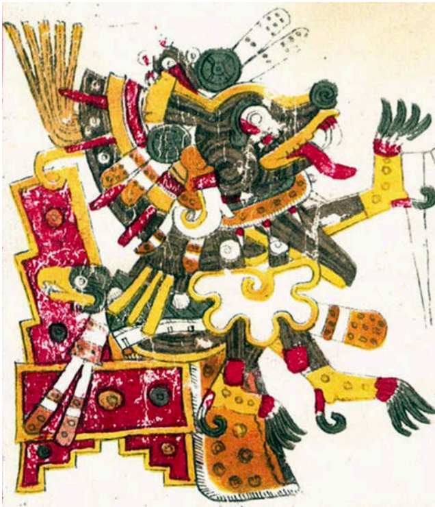
Figure 1. Representation of the deity Xolotl.

palustris , Ninpahea mexicana , N. gracilis , Typha dominguen- sis and T. latifolia (Lot-Helgueras and Novelo 2004) provide habitat for macroinvertebrates such as crayfish ( Cambarellus montezumae ), fishes ( Chirostoma humboldtianum , Girardinichthys viviparus ), reptiles ( Thamnophis eques , Diadophis punctatus , Barisa imbricata ) or amphibians ( Rana tlaloci and Ambystoma mexicanum ) (Rojas Rabiela 2004). These plants and animals are the habitat and food of more than 100 species of aquatic birds, like Pelicanus erythrorhynchos , Phalacrocorax brasilianus , Fulca americana , Ardea alba , Recurvirostra americana (Ayala-Perez et al. 2013). As a consequence, instead of reducing the biodiversity of the region, food production in the chinampas simultaneously increased native species populations (Voss et al. 2015). This Aztec city in pre-Columbian times grew based on the close relationship between “Mexicas” and the riparian and aquatic species from the wetland. Possibly, the most crucial interaction between civilization and nature was the axolotl, A. mexicanum , that was considered to be the representation of one of the most important Aztec gods, Xolotl (Figure 1; Bartra 2011).