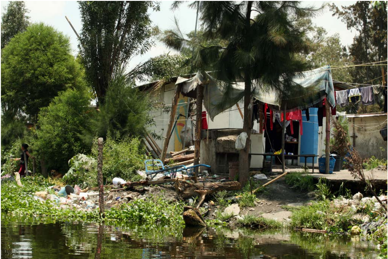
Figure 5. Urbanization of the wetland.

quality for the survival of the native species (Valiente et al. 2010). Therefore, the restoration loop we propose begins with water quality as a crucial first variable (Figure 4b). The Refuge itself is no longer the only goal, but a trigger for a general program to increase the water quality that helps the local biodiversity to survive. The axolotl is being promoted as a flagship species to ensure that products from chinampas with an axolotl refuge is pollutant-free.