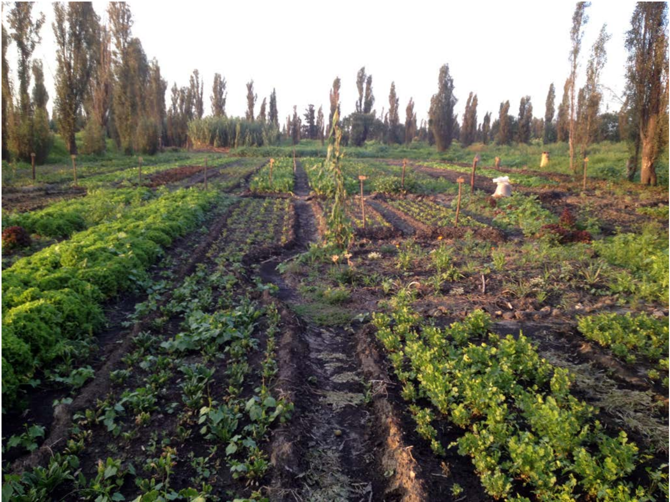
Figure 3. Traditional farming in Xochimilco with multiple crops.

and reproduced (Zambrano et al. 2015). This initial restoration program showed that Xochimilco canals can be highly resilient and return to native species after modifying only two variables: exotics and water quality (VonBertrab and Zambrano 2010, Tovar Garza 2014). Even axolotls reacted in weeks to better conditions. They increased their body weight (unpublished data) and during their reproductive season (in cold weather) laid eggs that were not subjected to exotic fish predation, which suggested a potential population increase within the refuge. The refuge became the habitat for all natives to survive the hostile environment generated by exotics and water pollution. Restoration based on the modification of a critical variable that triggers a modification of the rest of the ecosystem is typical (Rietkerk et al. 2004) in aquatic environments. For example, the reduction of zooplanktivorous fish in northern European shallow lake generates a significant change in the food web structure that altered turbidity of the water (Scheffer et al. 2001, Scheffer and Carpenter 2003). In shallow tropical systems, the abundance of benthivorous fish is highly related to sediment resuspension that also modifies the water (Zambrano and Scheffer 2001, Scheffer et al. 2003).