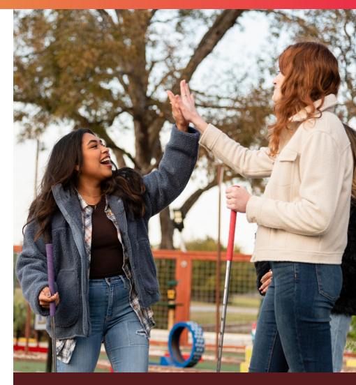
Enjoy downtown San Marcos for some

San Marcos is home to the Premium Outlets and Tanger Outlet Center, the third-largest tourist attraction in Texas. Nearby Austin and San Antonio also offers large shopping centers and malls. Austin is also home to the Whole Foods Market corporate headquarters and the company's flagship store. Shop for local arts and crafts at Market Days in Wimberley or Gruene. San Marcos residents enjoy perusing The San Marcos Farmers Market which offers local produce and homemade products.