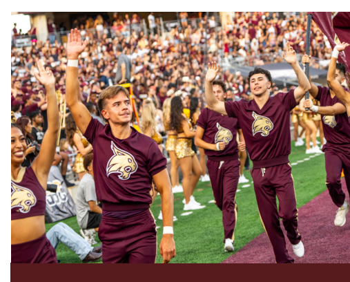
Enjoy a football game at Bobcat Stadium