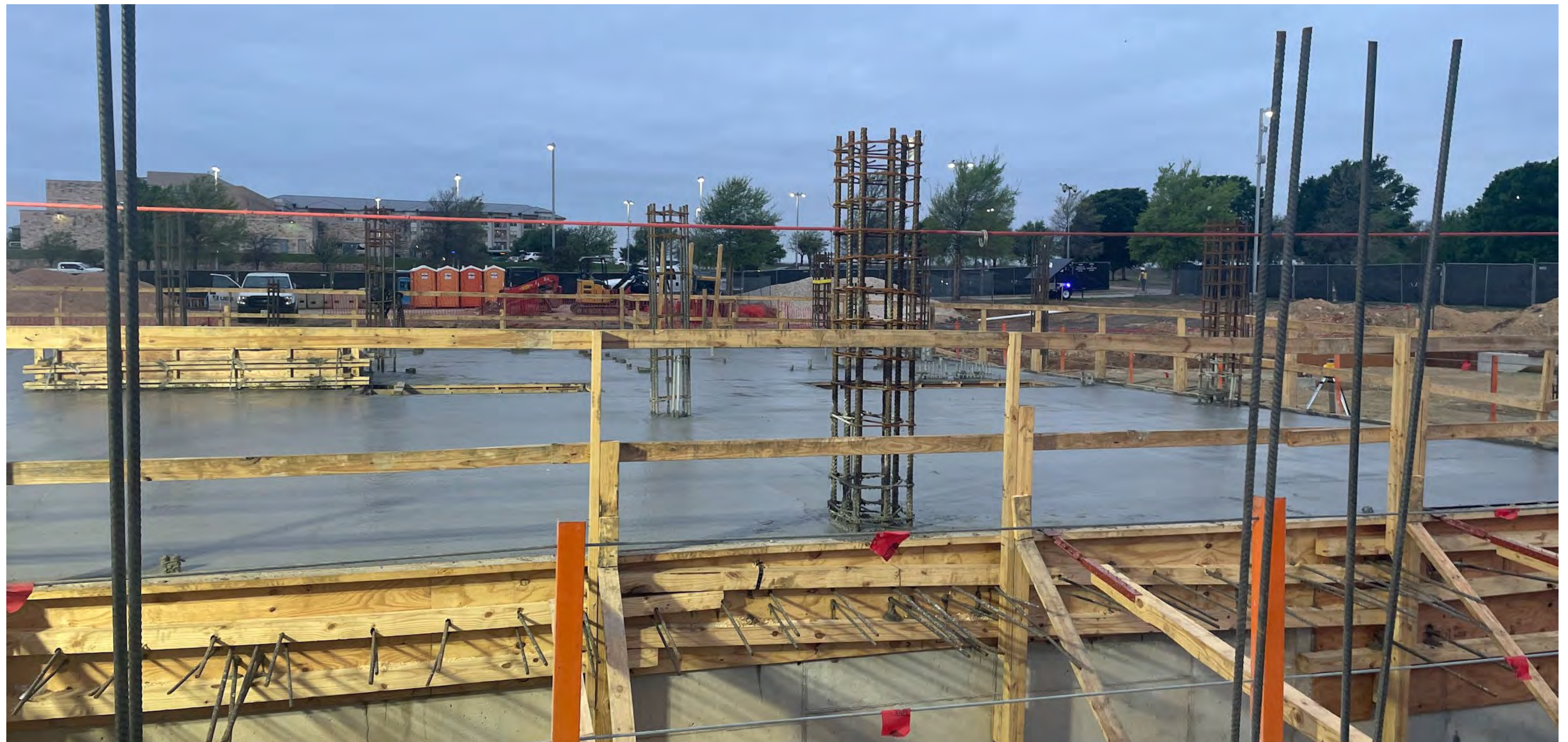
Esperanza – Level 1 Slab