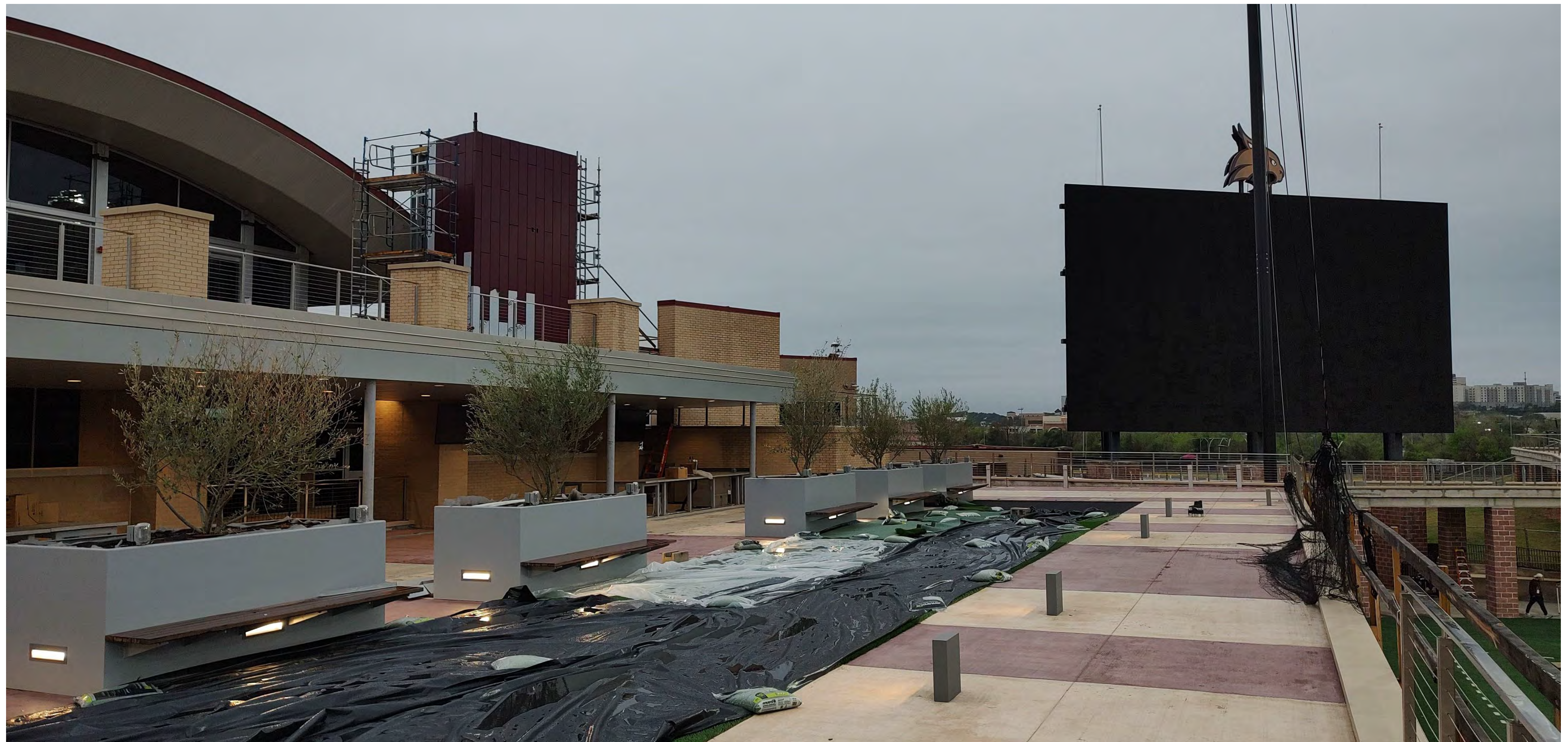
Roof Patio (Weight Room)