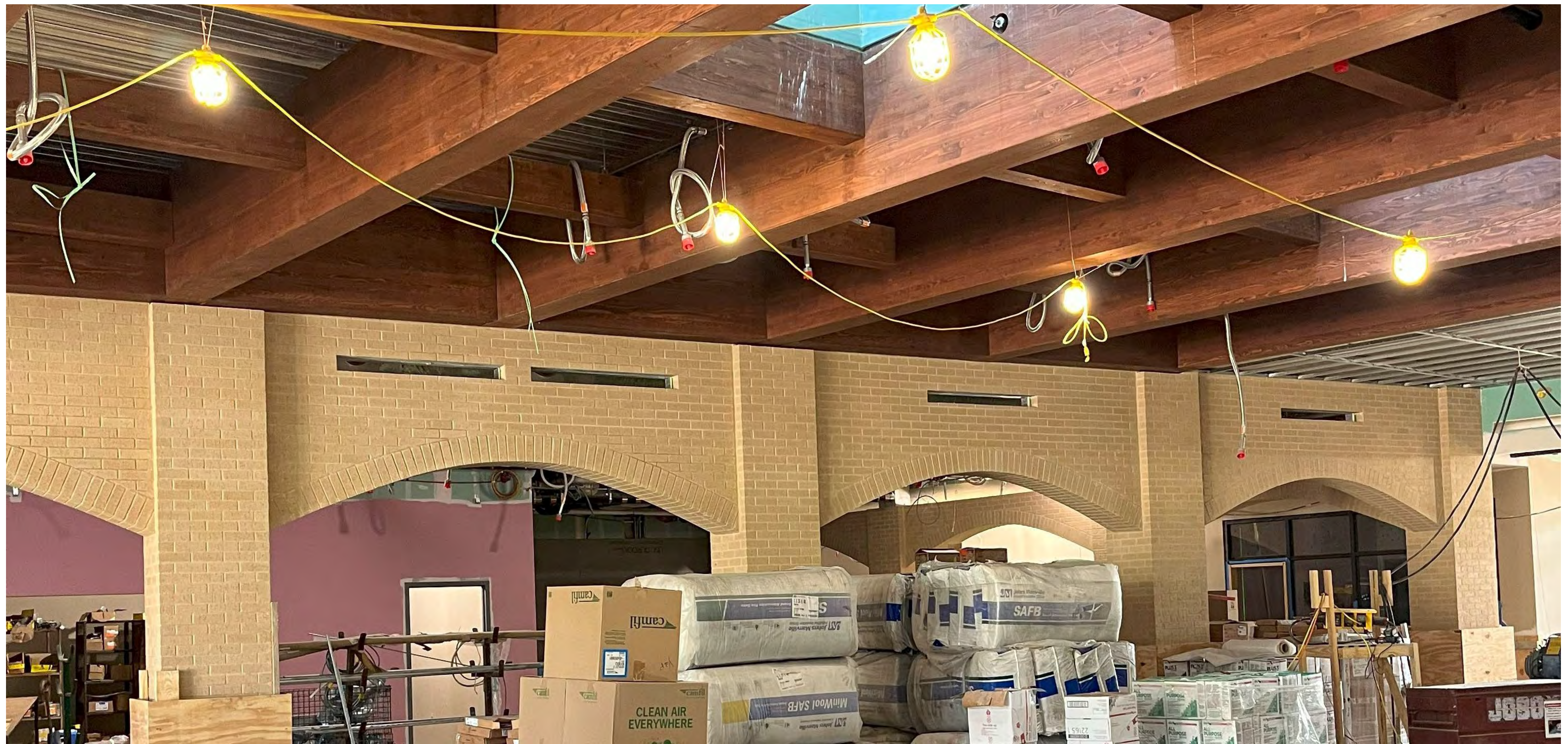
Castro – Entry Lobby