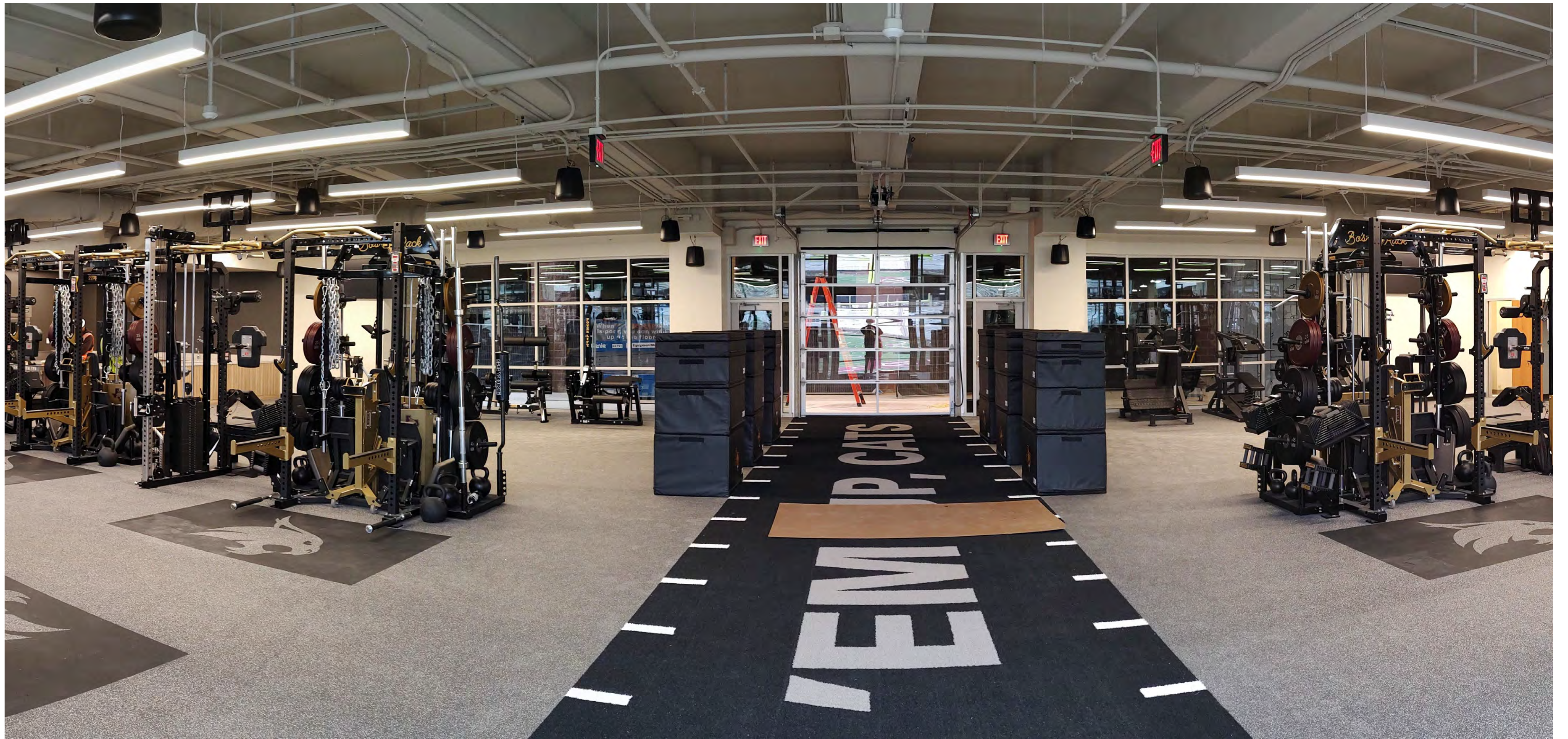
Weight Room - Interior