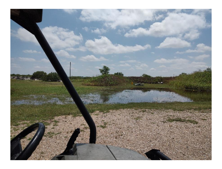
Fig. 01 Ponding in practice shooting zone.