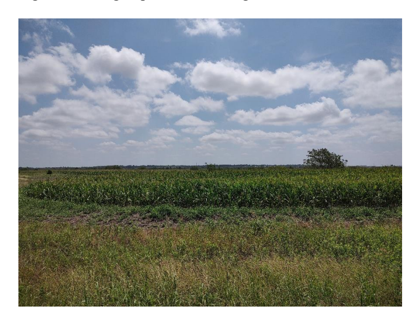
Fig. 02 Adjacent Corn Field