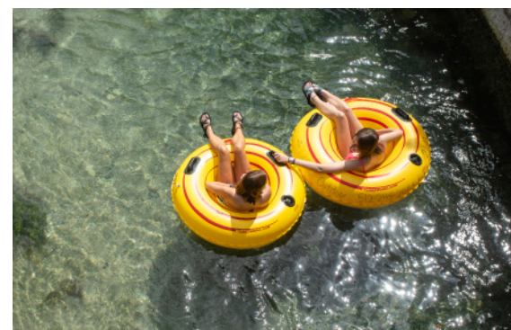
Soak up the sun at Sewell Park