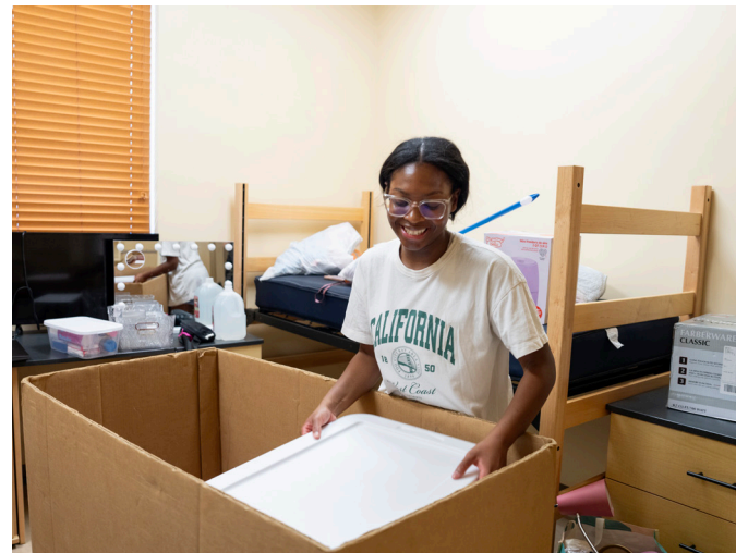
Over the course of three days, we will move over 10,000 new and returning residents into their TXST Homes