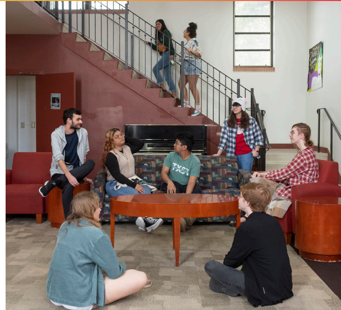
Residents gather in lobby spaces to enjoy community and RA programs

https://jobs.hr.txstate.edu/postings/53988