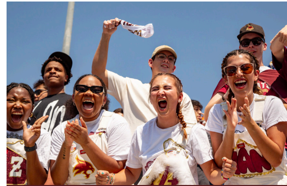
Cheer on the Bobcats at UFCU Stadium

San Marcos is home to the Premium Outlets and Tanger Outlet Center, the third-largest tourist attraction in Texas. Nearby Austin and San Antonio also offers large shopping centers and malls. Austin is also home to the Whole Foods Market corporate headquarters and the company's flagship store. Shop for local arts and crafts at Market Days in Wimberley or Gruene. San Marcos residents enjoy perusing The San Marcos Farmers Market which offers local produce and homemade products.